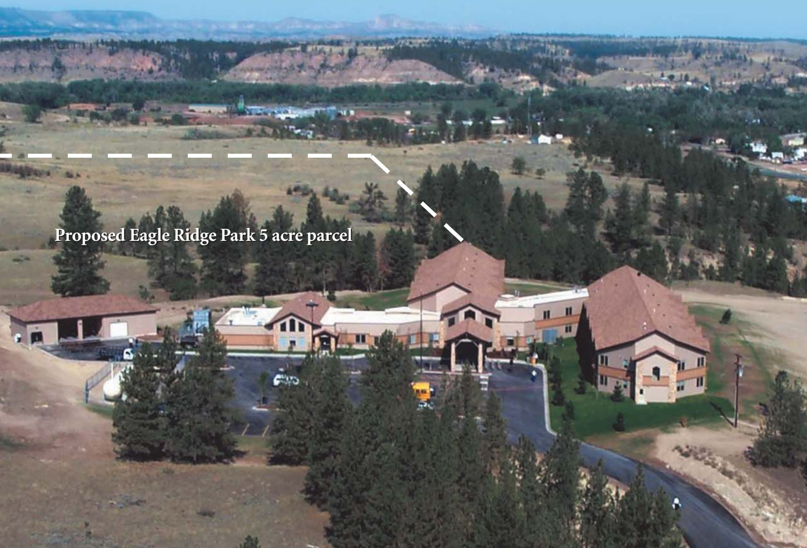
Proposed Eagle Ridge Park 5 acre parcel

OPTION 3: You may select decorative items such as a cross or eagle. These special 8 x 8 inch plaques, limited to 100 letters and spaces, are for gifts of at least $250.00 or more.