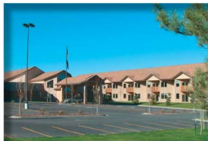
Eagle Ridge Park site is located next to the Heritage Living Center